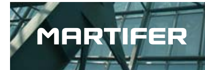
Martifer White Logo on dark image