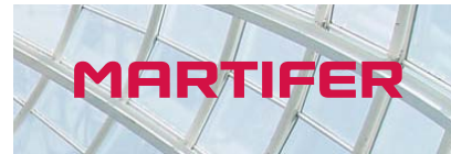
Martifer Red Logo on light image